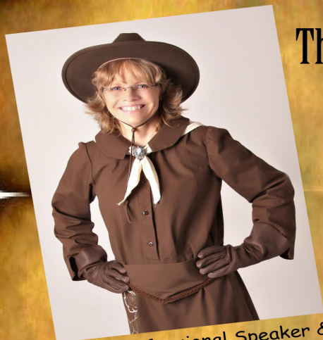
Author, Professional Speaker & Free Little Library Steward