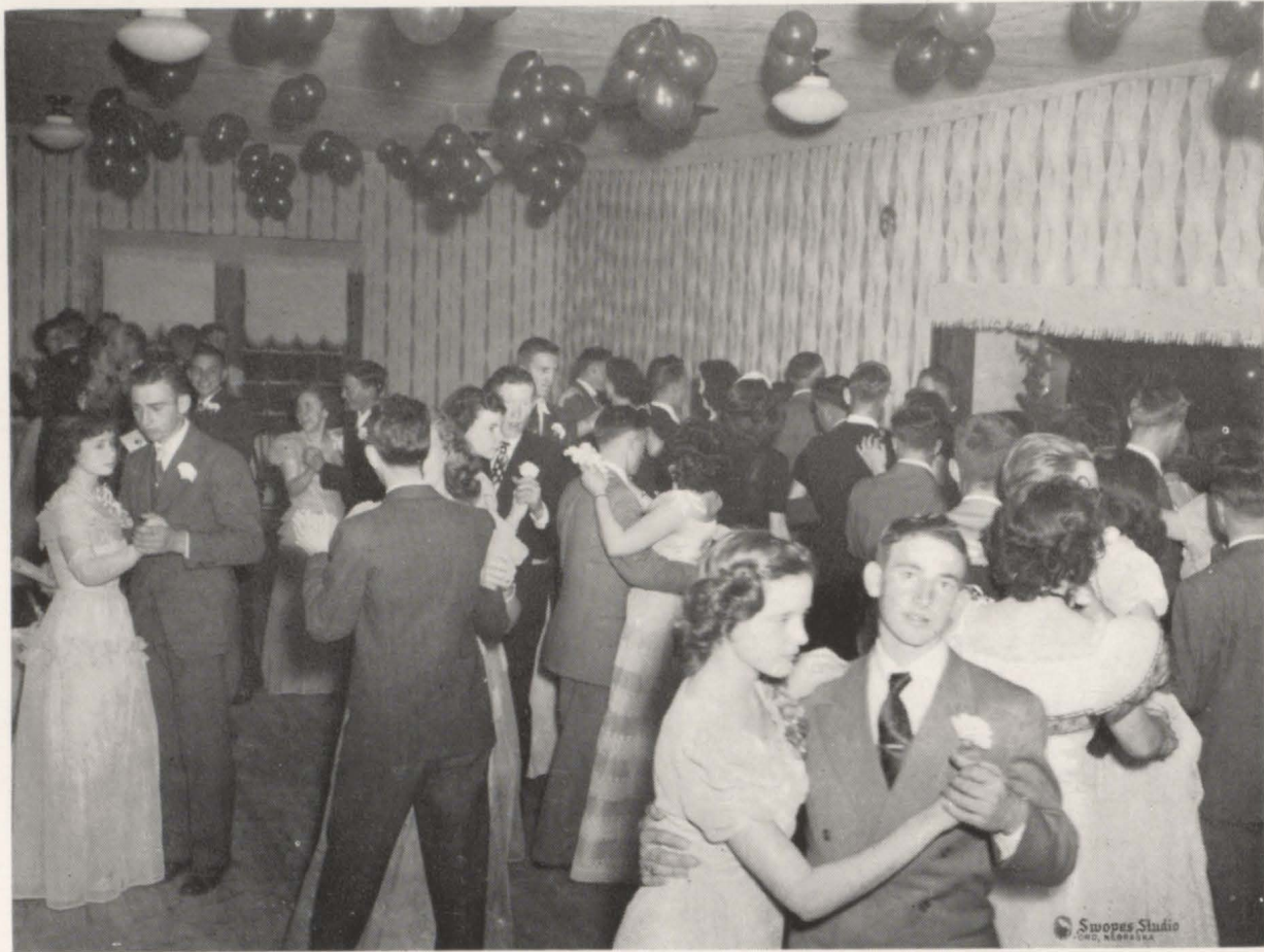
1950 Junior-Senior Prom

Treasure Island was the theme for the Junior-Senior Banquet of 1951. As the guests entered, they found themselves on a small island amid palm trees and stolen treasures.