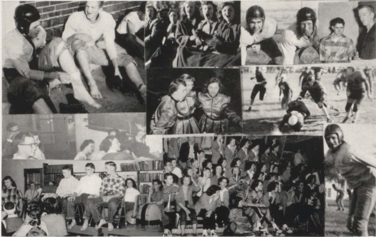
1. Legs? 2. Make 'em hear you! 3. Here we come! 4. Captains of our team. 5. Good game! 6. Park your car and hold your honey. 7. Let's go! 8. Hold your nose. 9. The gang. 10. Showoff? 11. A team we're proud of!