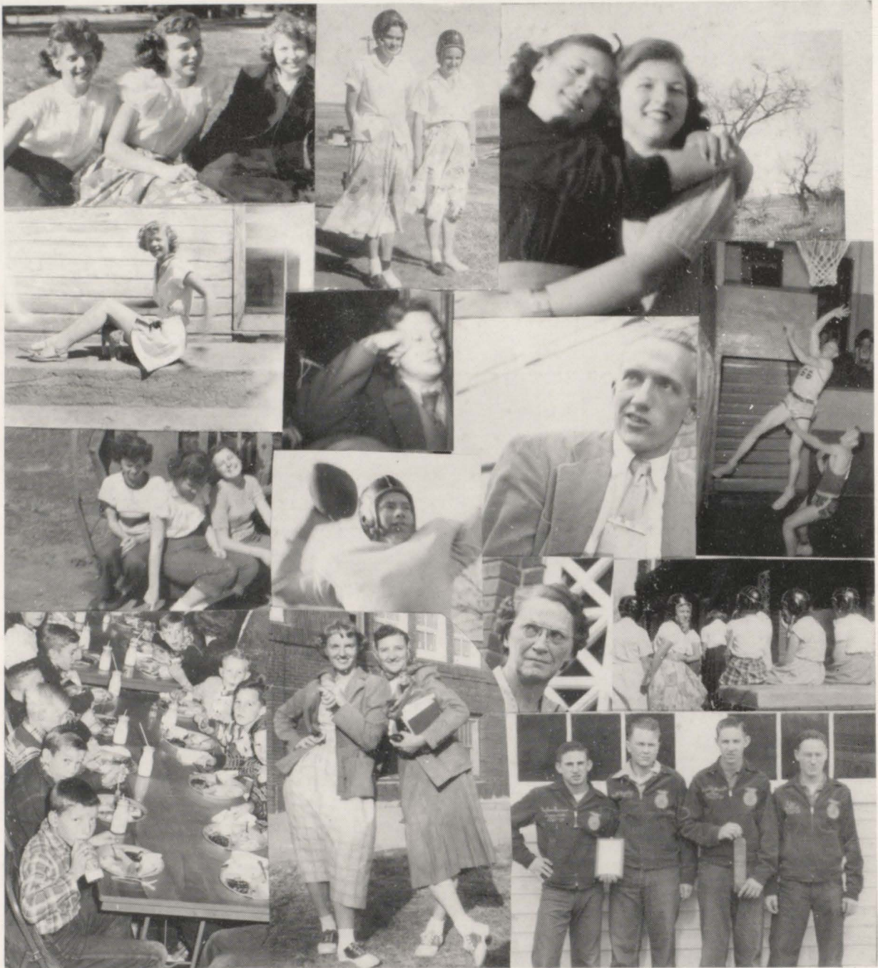
1. The Three Stooges! 2. Two of a kind. 3. Love at first sight? 4. Judge for a day. 5. Cute kitten! 6. Tired? 7. Hey there! 8. A basket! 9. What's so funny? 10. Warming up. 11. Our favorite red-head! 12. Aren't we dressed up? 13. Eat up! 14. What figures! 15. We are proud of you, boys.