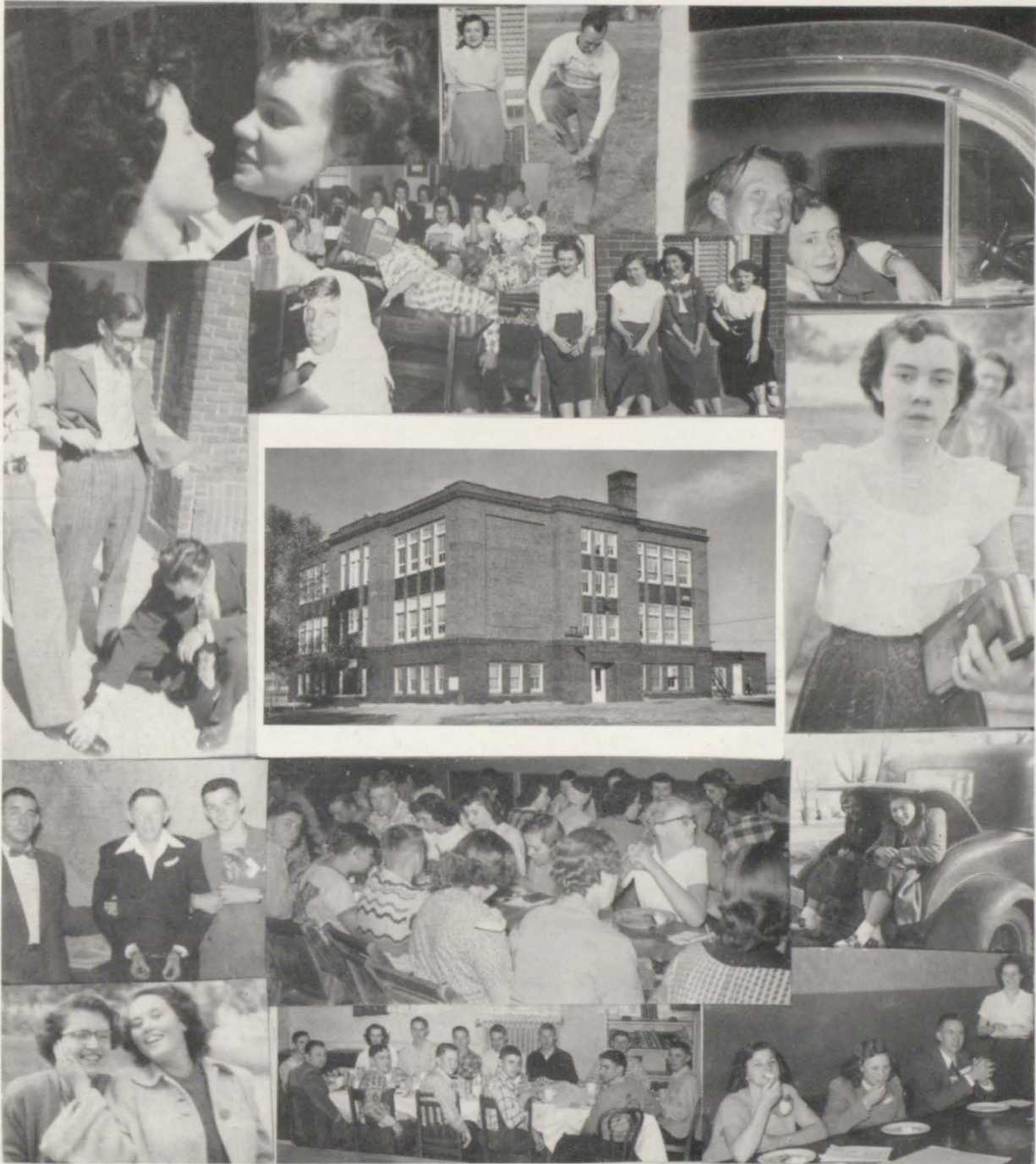
1. Hard-up. 2. Smile for the birdie. 3. Careful there. 4. Cozy, know? 5. What do we have here? 6. Sun bright? 7. Does it fit? 8. "So long, it's been good to know you." 9. Hard day at the office! 10. Caught! 11. M-m-m-good. 12. Service! 13. Smile and the world smiles with you. 14. A big family! 15. Hungry?