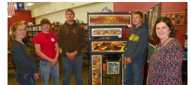
School Art show