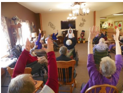
Chair Yoga at Alpine