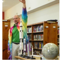
Apollo 11 program