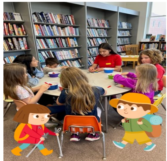
→ Creating a house for the Library Mouse