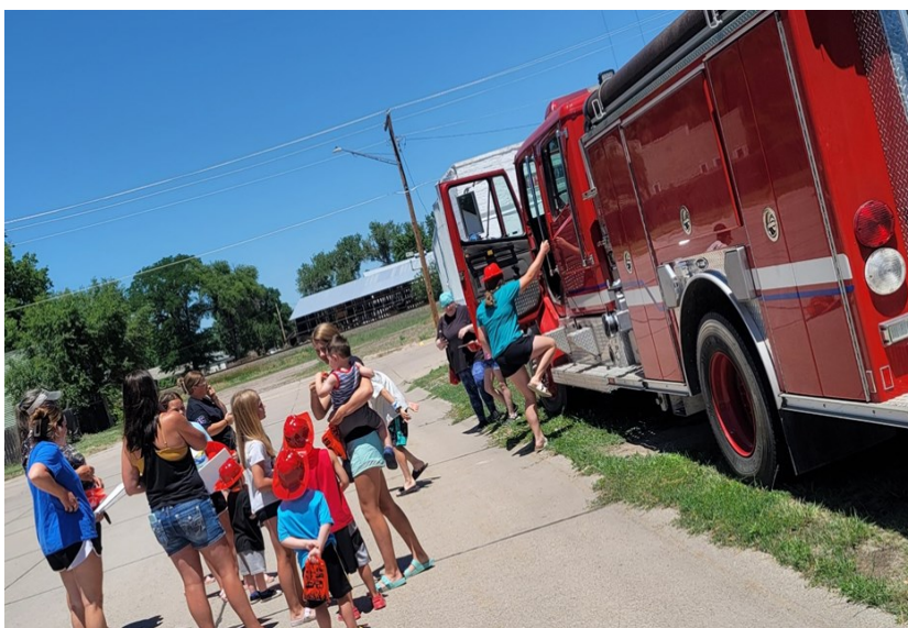
Meet & Greet with Smokey got a tour of the firetruck with our local firefighters!

Thank you to the Western Nebraska Library Commission with their generous grant that we used to help fund this summer's adventures!