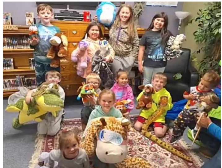
Pictures from left clockwise: Group photo with Smokey The Bear; Pick a Book Blindfolded; Making Fish prints; Bedtime Buddy Sleepover;