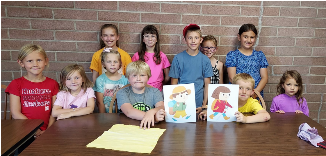
Children at the Hayes Center Library shared their Summer Reading Program activities with Ned and Nelly.