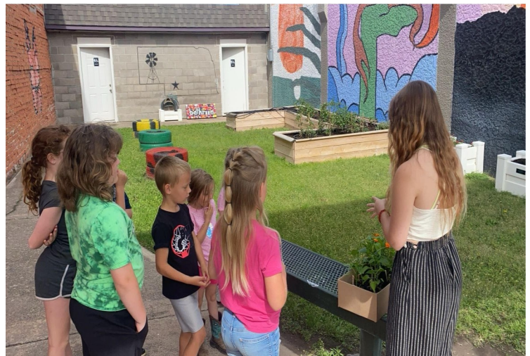
The Summer Reading Program starts off the community garden.