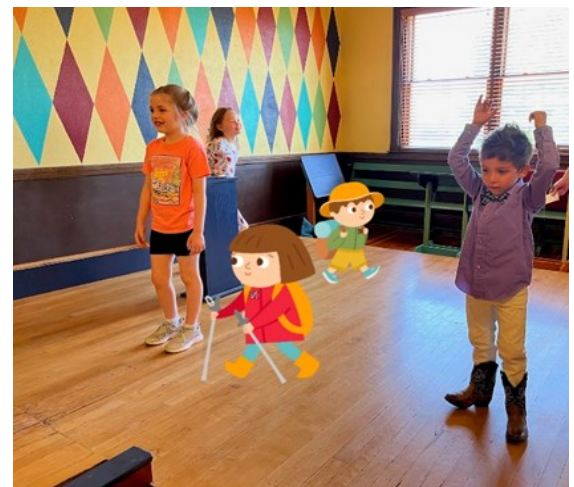
→ Adventure at the Potter Duck Pin Bowling Alley