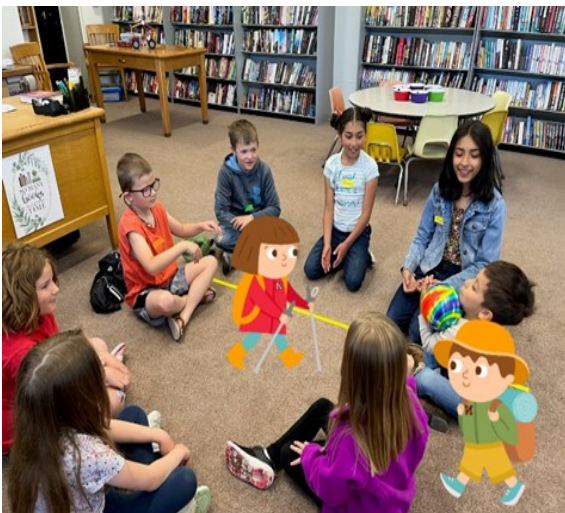
← Games are a part of the summer adventure.