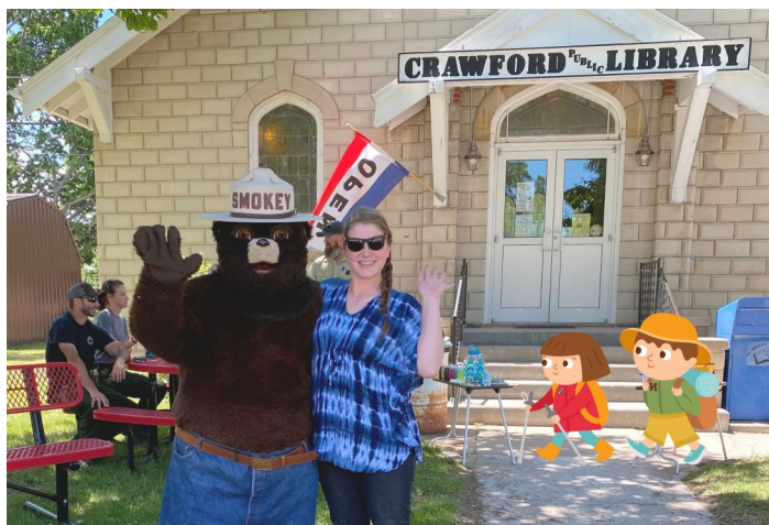
Ned, Nelly and Ashy celebrate Smokey the Bear's birthday