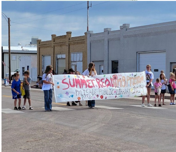
Palisade Public Library's Summer Reading Program walking in the Palisade Pioneer Days parade.

Age groups were split up K-3rd from 10:30am-11:10am, 4th-7th from 11:50 am-12:30 PM. The program was held every Monday through June and July. Both groups received the opportunity to plant a variety of plants in our Palisade Community Garden. Kids kept track of their plant they had been assigned to and tracked the plant's progress during the program. They participated in our planned crafts and activities! During activities, snack time was included as well!!