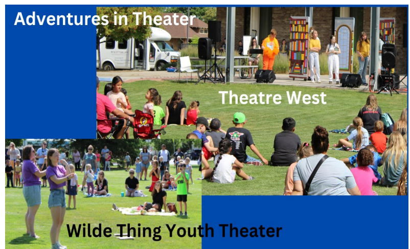
Adventures in Theater