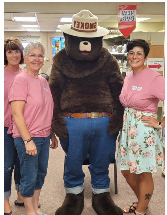
Oshkosh Public Director & Assistant & Volunteer posing with Smokey the Bear