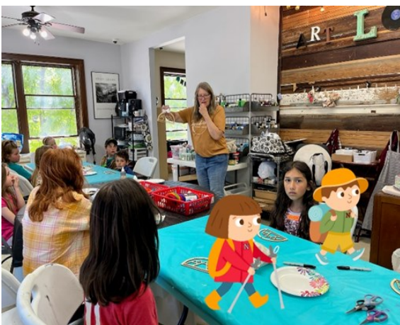
← Creating a nature craft at the Potter Art Loft.