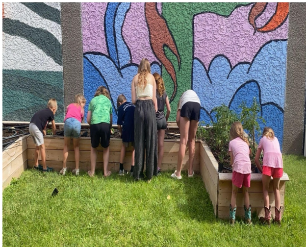
The Summer Reading Program fixes up the community garden.