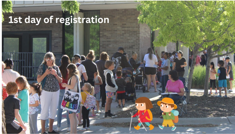
1st day of registration

This year, we decided to try two take-home craft kits. For the first, we made a rocket that flew using straws and pipettes, and the other was a bookmark using wood medallions cut on the library's laser cutter. The kits were very popular and we gave out around 600 over three weeks. We also set up an Oregon Trail themed scavenger hunt around the library. The hunt took them not only around the library, but also through the trail from Missouri to Oregon, learning what life was like for the pioneers along the way.