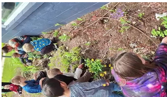
Planting time in the Butterfly Garden.

Thank you again to WLS and their generosity that has given our local kids additional access to summer learning and activities!